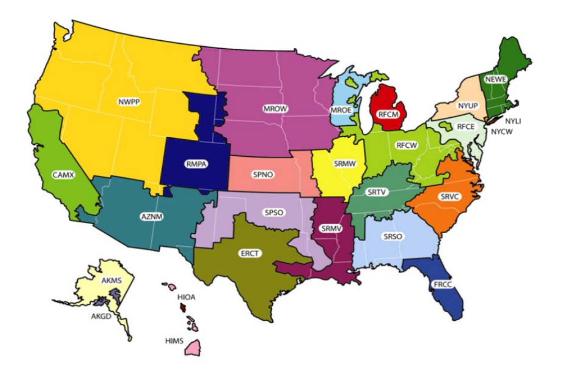
Figure B.1. Map of eGRID2007 Subregions